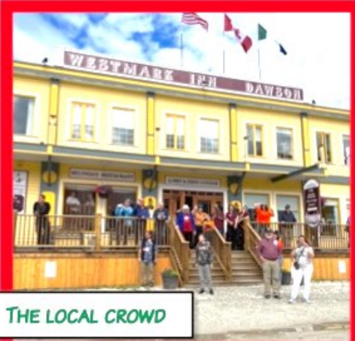
THE LOCAL CROWD