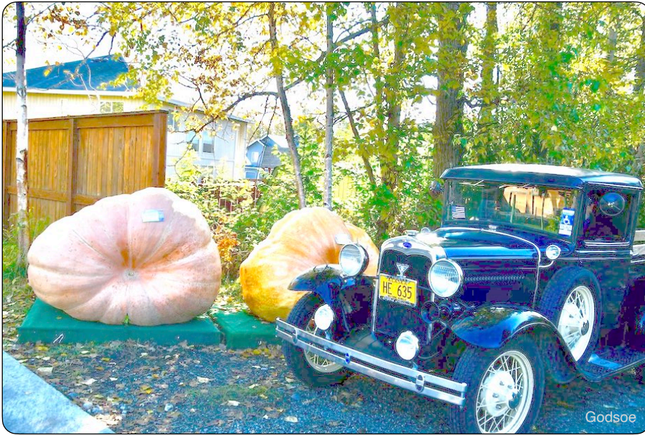
Pumpkin pie anyone? How about pumpkin spice? Kathleen Godsoe took this photo not very far up Strawberry Street from her home. Who could resist a photo op with these two Alaska State Fair celebrities? Can you believe 1,240 lbs.!!?