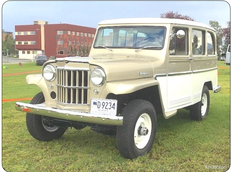
1962 Willys 6-230 utility wagon

before realizing that it really needed a total restoration. I wasn't in a position to do that at the time, but I hung on to it as I pursued my career and moved several times, while using other Jeeps as my daily drivers. And the classified ads in the newspaper provided further distraction, prompting me to acquire another of my dream Willys Jeep vehicles, an FC-170 pickup that I quickly began to restore. Still other vehicles came and went while the Willys wagon sat waiting.