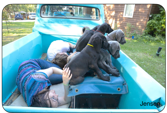
This is a behind-the-scenes photograph of the team holding puppies in place in the bed of Chunky. Did you ever wonder how he did that?