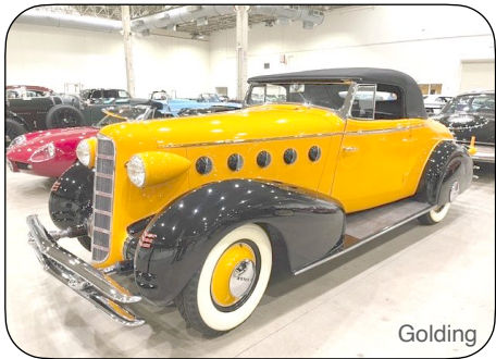
1934 La Salle convertible coupe on display at Navy Pier in Chicago.