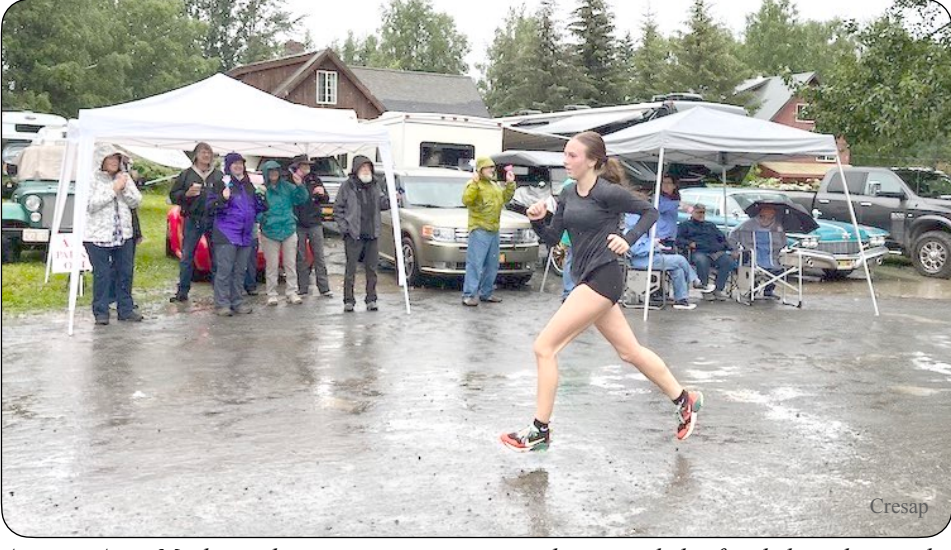
Antique Auto Mushers cheer as a runner passes by toward the finish line during the Hope Wagon Trail Days 5-K run.

Adopt-A-Road 9 am Saturday, September 2nd