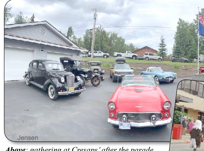
Above : gathering at Cresaps' after the parade Right: staging in Anchorage