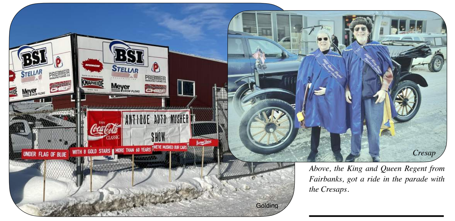
Above, Brown's Services, Inc. the site of our Rondy show, was festooned with BurmaShave signs.