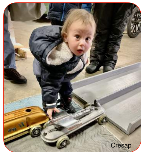
Rosco, one of our miniature guests, was totally enthralled by the valve cover cars.