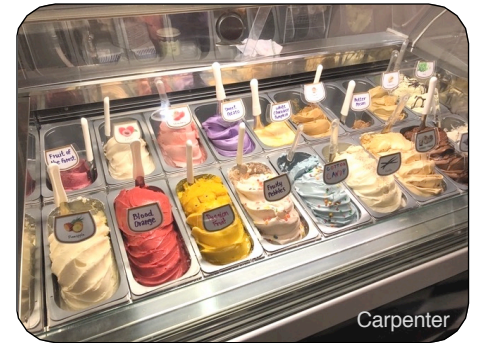
The choice of ice cream at Sweet Darlings was superb and very tempting.