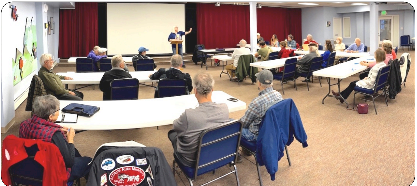
25 members present