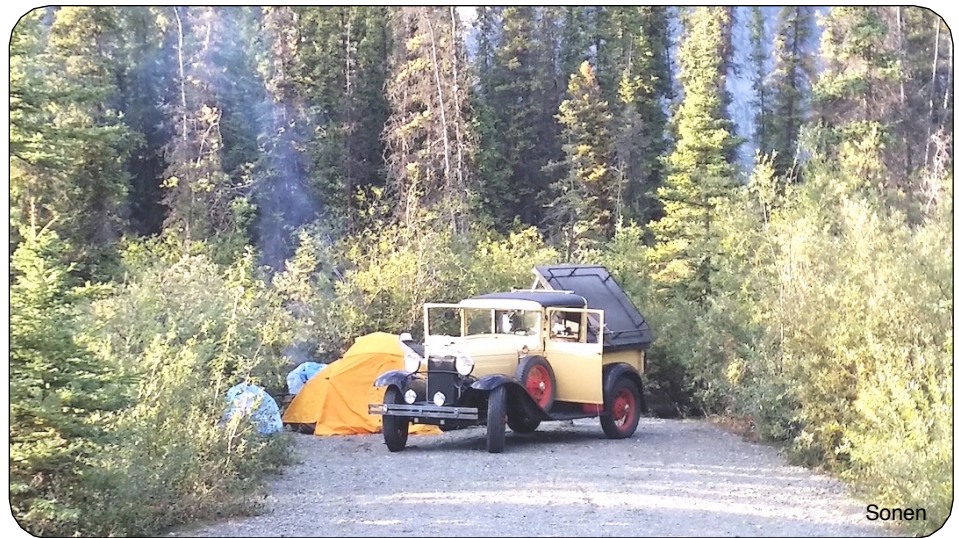
This idyllic campsite is but one of many they shared on their Model A Odyssey.

at 7:AM the next morning, "don't come any earlier", we were 1st in line again and waited 2 hours before an agent came to speak with us. we were granted 6 days transit instead of the usual 4 as a nod to the age of our vehicle. actually the young agent that morning was quite nice. we were not to camp. apparently the normal tourist industry was hurting like everyone else and the requirement was made that through travelers to alaska (including self-contained RVs) were to stay in established places of