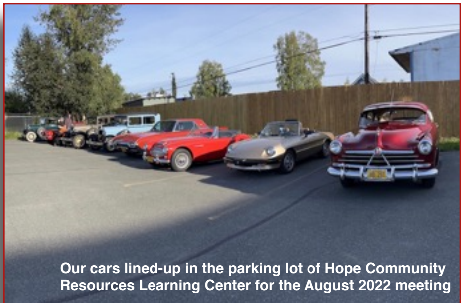
Our cars lined-up in the parking lot of Hope Community Resources Learning Center for the August 2022 meeting