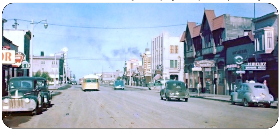
4th Avenue near E. Street.

Fall at the Jensen cabin always includes a fair amount of tidying up inside and out. It's easier to haul stuff to the dump when it's warm outside.