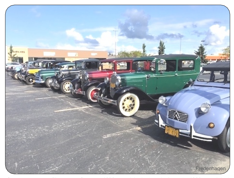
Cars at Kenai Shopping Center: 1929 Model A (Fredenhagen) 1930 Model A (Robinson)1931 Model A Taxi (Dryden/Woodard) 1951 Chevrolet (Cruze) 1931 Model A pickup (Godsoe) 1930 Model A (Piper) 1930 Model A (Fena) 1986 Citroën (Golding).

be the first customers! The food was excellent, especially the seafood tacos.