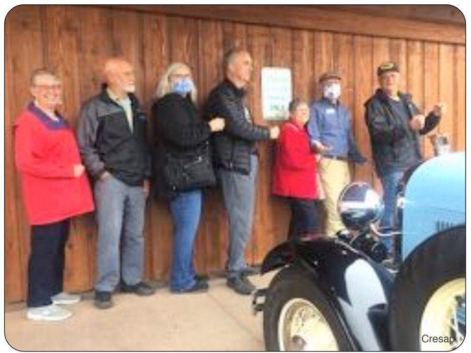
The Artic Roadrunner: What do you mean, "Senior Citizen Parking only?" Who in this group is a senior citizen? Ya gotta be kiddin'.