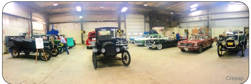
The 2020 Rondy car show took place in two shops at BSI in north Anchorage. The West Shop was nick-named "The Ford Barn" for obvious reasons