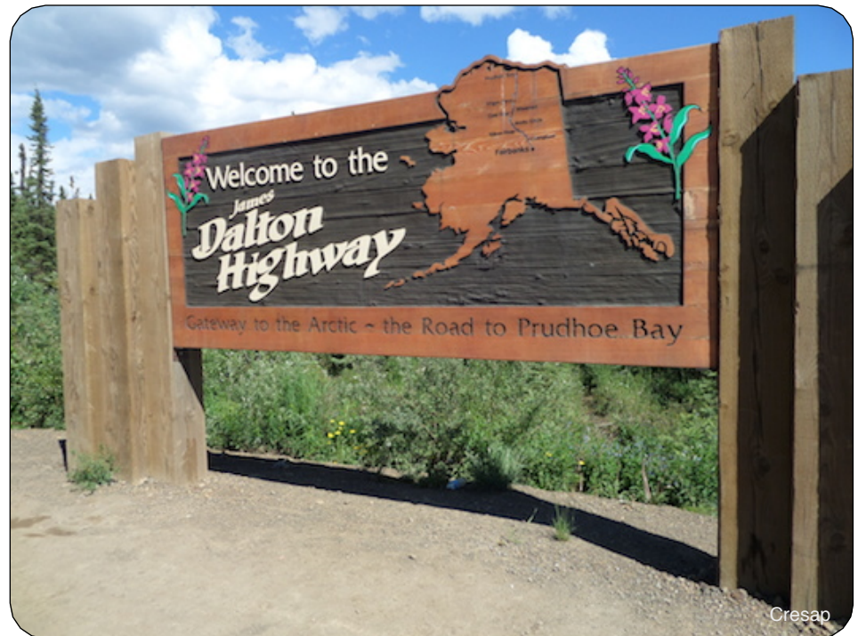
One of the options during the 2020 Long-Distance Tour is a visit to the location where the Dalton Highway crosses the Arctic Circle. We are still considering tour ideas.