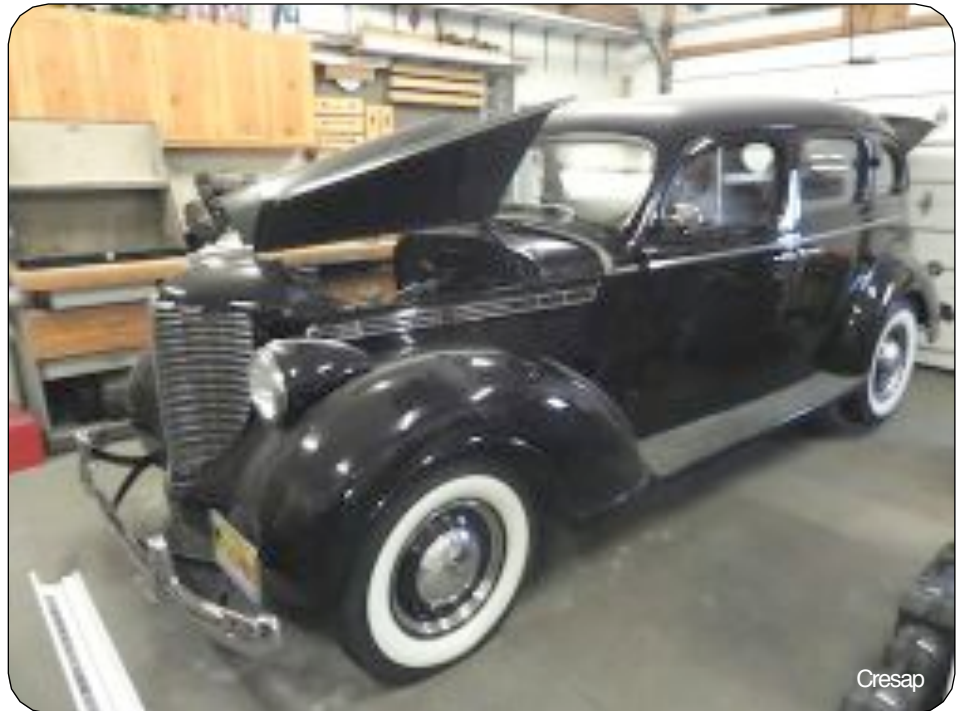
Your Tinkering Times editor pulled his 1938 Chrysler Royal into his shop to perform maintenance, repairs and part replacement that had been waiting to be done throughout the winter months. He joins other AAMA members who are surely doing the same.