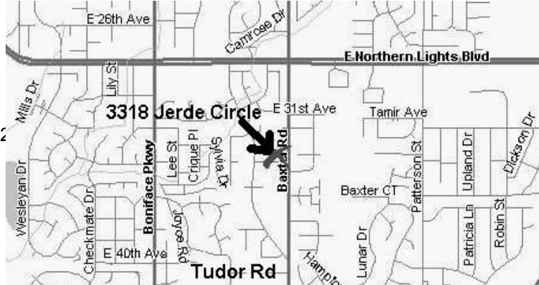
Map to Robbie's Club House